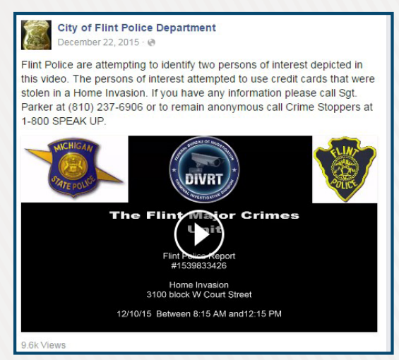
Flint Police Department Facebook page DIVRT crime video posted December 22, 2015.

In the coming months, Flint VRN will examine opportunities for domestic violence technical assistance, support in expanding analytic capacity within FPD, Blue Courage training, procedural justice training, homicide investigations assistance, COPS Office Applied Evidence-Based Homicide and Violence Reduction training, OVC's Enhancing Law Enforcement's Response to Victims (ELERV) Initiative, and Foundations for Intelligence Analysis Training.