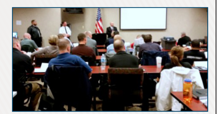
FBI DIVRT training delivered to Phase 2 VRN sites in Philadelphia, Pennsylvania – November 2015.

Next quarter, Newark VRN is looking forward to a VRN team site visit along with DMI, Crime Prevention Through Environmental Design, Crime Analysis for Executives, Blue Courage, and Milwaukee Homicide Review trainings and other technical assistance.