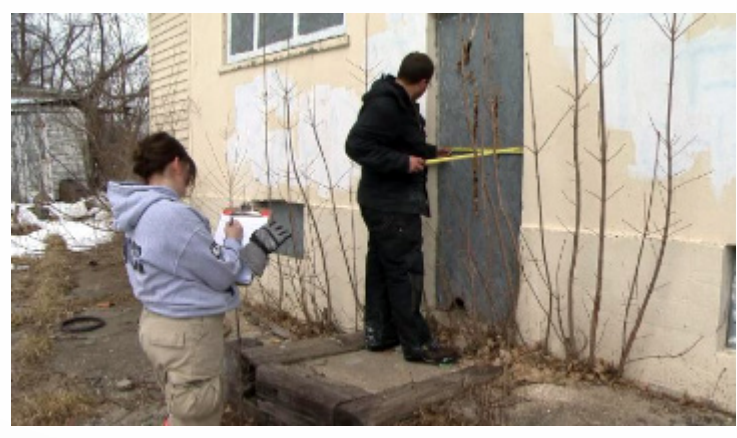
AmeriCorps volunteer and Flint PD officer examining blight property

Gang violence reduction is a priority for Flint's PSP engagement. As a result of a comprehensive gang assessment conducted in February