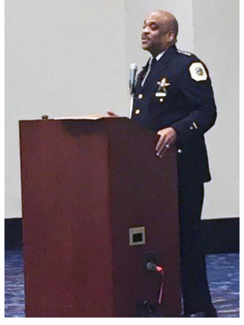
Chicago PD Superintendent Eddie Johnson addressing attendees at the Chicago Crime Fighters Conference

On the first day of the conference, the participants had the opportunity to visit the Chicago PD's Districts 7 and 11, where district commanders provided insights on the establishment and implementation of the SDSCs, crime analysis capabilities, and community outreach strategies. The participants also toured the SDSCs, observed the daily commanders briefing, visited the University of Chicago Crime Lab, and attended each district's weekly shooting review. Other topics addressed included the Chicago PD's violence reduction strategy and the weekly review debriefing, a Chicago 2016–2017 case study, and the state's attorney's role in SDSCs. DOJ Associate Deputy Attorney General Steven Cook and BJA Deputy Director for Policy Kristen Mahoney also provided remarks on the national perspective on violence reduction.