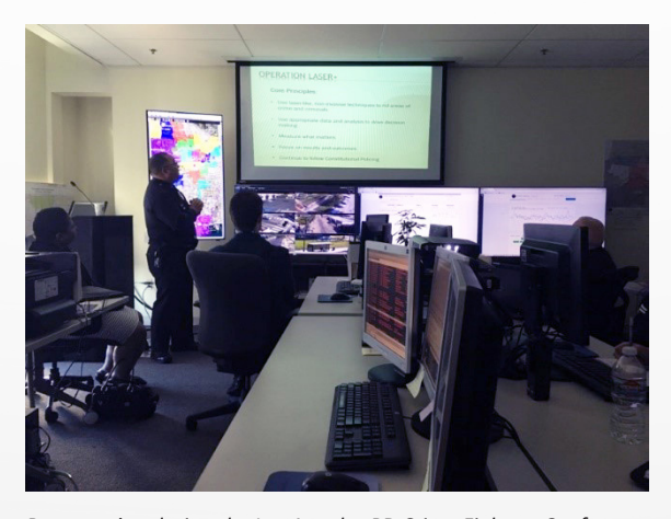
Presentation during the Los Angeles PD Crime Fighters Conference

Mayor Eric Garcetti and the Los Angeles PD's then-Chief Charlie Beck provided opening remarks on the second day of the conference. Chief Beck also shared his vision for the PD, including building trust and improving effectiveness. During the second day of the conference, the participants learned about topics such as leveraging technology in the crime fight, constitutional policing, the Los Angeles PD's Transit Operations Bureau, a Chicago PD case study on violent crime reduction, gun violence, and the Los Angeles PD's analysis of 2017 and direction for 2018.