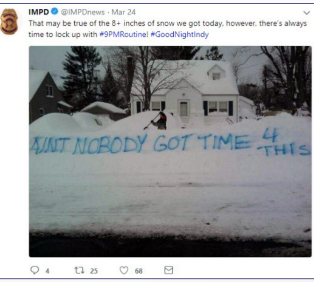
Indianapolis Metropolitan PD Twitter post about #9PMRoutine

The Indianapolis Metropolitan PD implemented several new strategies to reduce violence this quarter. The PD is piloting beat patrols to supplement its current zone patrols to allow officers to increase engagement with the community.<sup>13</sup> The PD started a new social media campaign, #9PMRoutine, that aims to prevent auto theft and home burglaries by reminding citizens to remove valuables, especially guns, from vehicles and lock all doors as part of their nightly routine. <sup>14</sup> As a result of lessons learned during the Los Angeles PD Crime Fighters Conference in February, the Indianapolis Metropolitan PD now holds daily meetings to examine crime analysis, resource deployment, and neighborhood activities at a micro level. These daily meetings are held in addition to the Indianapolis Metropolitan PD's previously established monthly CompStat meetings that evaluate activities at a macro level. The PD made technological advancements in 2018 as well, including the replacement of its records management system and Computer-Aided Dispatch (CAD). The new CAD will provide analytics for in-depth analysis and predictive modeling.