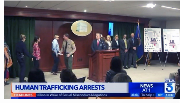
LASD news conference announcing results of a successful human trafficking operation

Another focus area for Compton PSP partners is to reduce human trafficking and increase services and support for crime victims. In January, the LASD led a joint human trafficking sting with the support of 85 additional federal, state, and local agencies that covered both street investigations and internet crimes. This operation resulted in 510 arrests and 56 rescued victims. The Office for Victims of Crime (OVC) Training and Technical Assistance Center conducted a human trafficking and victim services assessment in Compton in May 2017. As a result of the assessment, Compton-area partners are implementing a task force of victim service providers to support victims of violence. OVC's subject expert is working with the human trafficking task force, Compton schools, and probation on this effort. In addition, the partners plan to establish a family justice center to