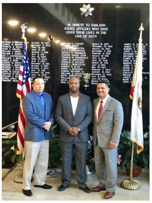
Representatives from the MPD visiting the OPD

Nashville, Tennessee, began the planning stages for a violence analysis assessment. A site visit to collect data for the analysis will occur next quarter. The goal of this assessment is to understand the scope and nature of violence in Nashville to form recommendations for the Metropolitan Nashville Police Department (MNPD) to design a comprehensive response to violence in the areas of prevention, intervention, and suppression strategies. One aspect of the MNPD's comprehensive response to violence is the PSP strategic plan it developed to address homicides and investigations, crime analysis, gun violence, and commercial robberies in selected MNPD districts and department-wide.