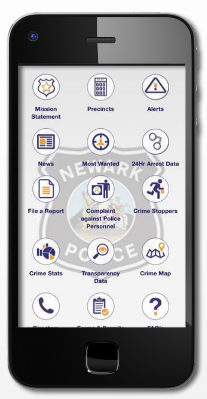
Newark's new phone app

Representatives from the WMPD visited the Arvada, Colorado, Police Department (APD) on June 14, 2017, to explore its Lumen technology. The WMPD has begun using Lumen technology as part of some of its data initiatives, such as Operation DETER, and the APD is an early adopter of the Lumen platform. Lumen software is a police database that permits users to search and analyze data from disparate data sources, allowing information about such subjects as people, vehicles, incidents, and locations to be easily found. The APD uses the Lumen platform to drive its data-driven and problem-solving strategies. The WMPD and the APD discussed using Lumen for such items as sector briefs, operational planning, directing patrols, and assisting in investigative analyses.