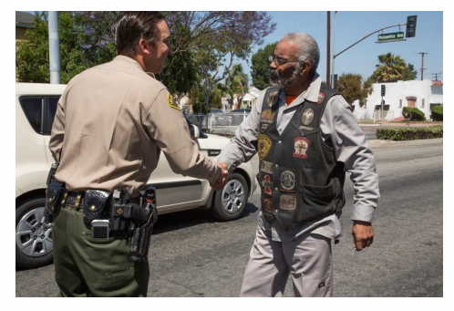
LASD Compton deputy engaging with community member

Compton identified community engagement as one of its three primary issues to focus on in its public safety strategic plan. To bolster community engagement efforts in the city of Compton, law enforcement partners participated in numerous youth programs, including Cops and Kids, Gang Resistance Education And Training (G.R.E.A.T.), a summer tennis clinic, cyber training, digital citizenship training, and FBI online predator training. Compton is also taking steps toward the implementation of an additional Youth Athletic League, providing more youth the opportunity to join in the activities. In order to reduce violent crime and time spent processing misdemeanor arrests, Compton Station has adjusted its patrol strategies to allow officers to spend more time on the street and mediate small disputes when possible. Compton believes that this increased visibility and mediation strategy is positively affecting its violent crime rate and has reduced its response times to violence calls. The LASD—Compton Station has reduced its response time from about 15 minutes to about 6 minutes.