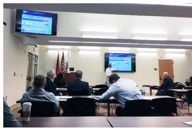
Analysts attending a presentation during the inaugural Crime Analysis Community of Practice meeting in Charlotte, North Carolina

This Community of Practice helps ensure that crime analysts are fully empowered and leveraged as critical team members within their agencies and in local efforts to reduce violent crime. On April 26–27, 2018, crime analysts from PSP sites Birmingham; Indianapolis; Little Rock; Milwaukee, Wisconsin; Nashville, Tennessee; New Orleans, Louisiana; St. Louis; Toledo; West Memphis; and PSP alumni sites Camden, New Jersey, and Wilmington, Delaware, gathered in Charlotte, North Carolina, for the inaugural Crime Analysis Community of Practice meeting. The Charlotte-Mecklenburg