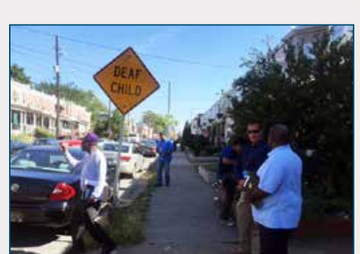
CPTED Training Attendees