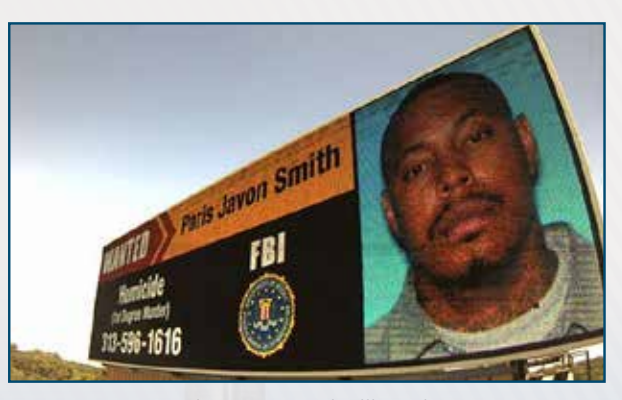
First suspect posted on FBI Digital Billboard in Detroit in August 2015.

Detroit continues to move forward with the implementation of Michigan State University (MSU) graduate student analysts in the VRN Detroit partner agencies, as well as its work with domestic violence fatality review.