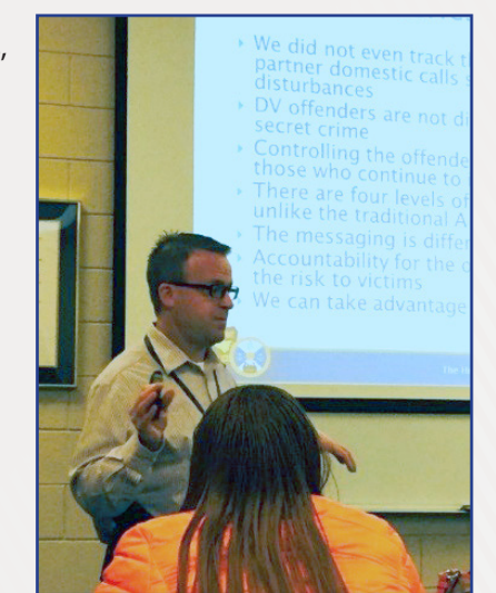
Presentation at HPPD site visit

"[The VRN] provides an opportunity for agencies to interface with the federal agencies to dialogue about different types of resources. It's beneficial because we can focus on best practices."